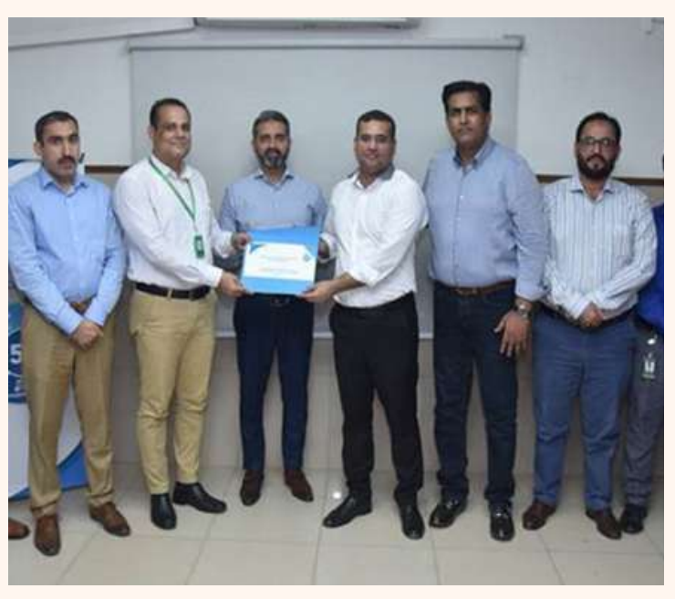
Head CHSEQ presenting 5S completion certificate to GM Tech Johar