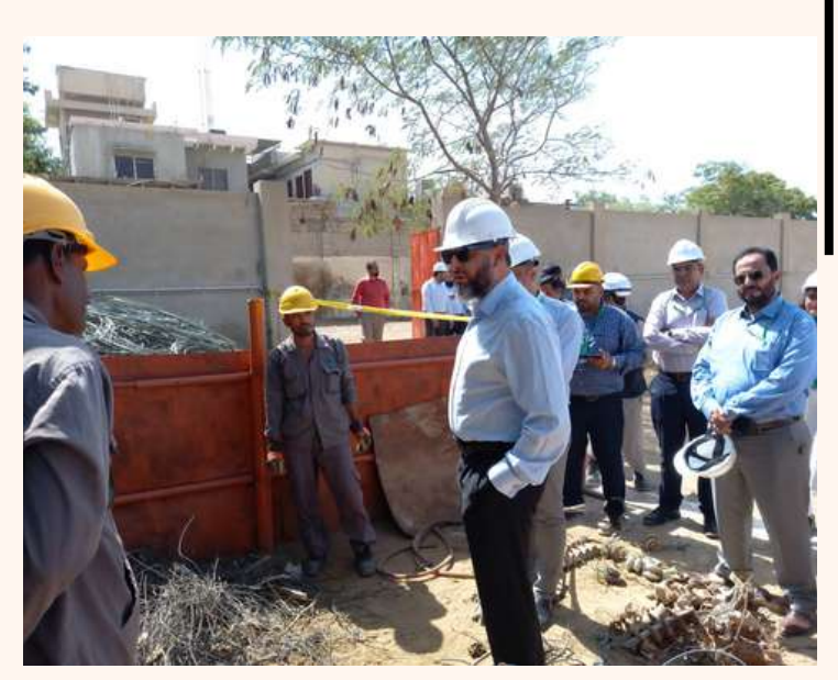
5S Project: CEO, CSCO, and CHSEQ Head at Baldia Scrap Yard