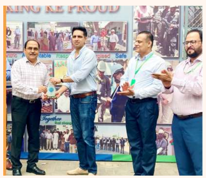
Leadership GEMBA Walk at IBC Lyari