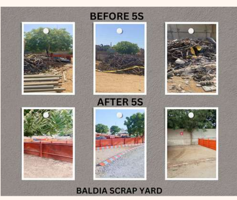
Transformative 5S Impact in Baldia Scrap Yard