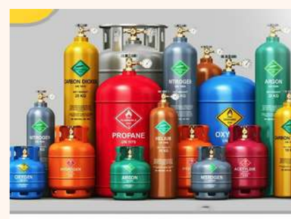
Guidelines for Safe Handling, Storage and Usage Compressed Gas Cylinders

KE-CHSEQ-RP-058 (attached) outlines the organisation's procedure for ting audits and inspections to assess process quality and ensur ince with ISO 9001:2015. This procedure will be effective from 10<sup>th</sup> July 2023, allowing a three-month timeframe for complete implem Subsequently, compliance will be assessed to ensure adherence to the